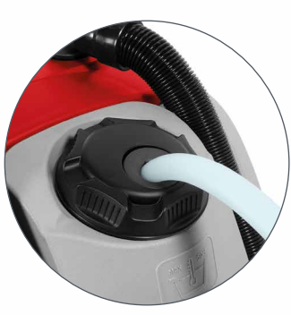
Vispa EVO is ready to use in a very short time and the clean water filling operation is even faster thanks to the crevice with filter on the front-mounted hopper cap.