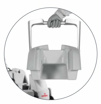
Full access to components makes it easier to carry out both routine and extraordinary maintenance. The recovery tank has a handle so it's easier to lift it for emptying.