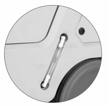
Full visibility of the solution level in the scrubbing machine, thanks to the transparent indicator on the side of Vispa EVO.

For this reason, the parts requiring daily maintenance are distinguished by their yellow color. In this way, the operator can easily identify the parts to be sanitized at the end of the shift.