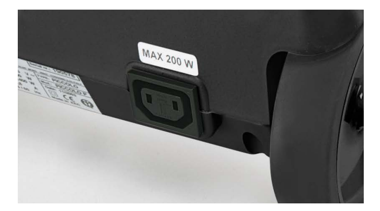
CA 15 EXTRA and CA 15 SILENZIO are equipped with a handy additional socket for powering an electric brush.