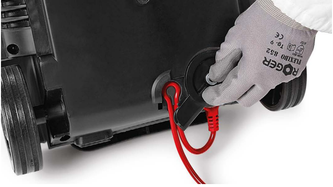
CA 15 EXTRA and CA 15 SILENZIO have a system that allows the replacement of the power cable by the user.

CA 15 EXTRA and CA 15 SILENZIO are equipped with a removable accessory holder placed in the back to allow you to have all accessories at hand and a warning light to signal when the