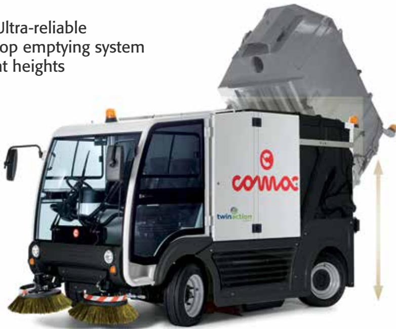
h 180 cm

Ultra-reliable top emptying system at heights