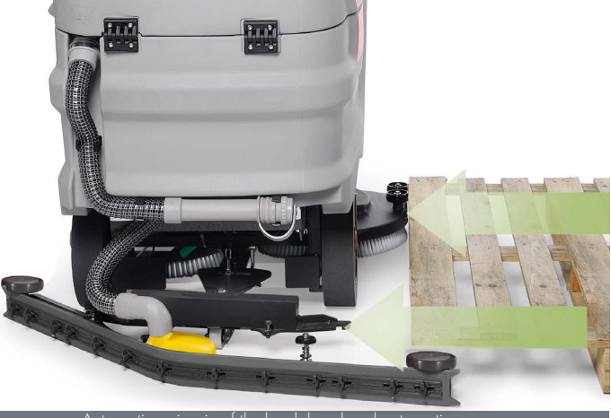
Automatic swing-in of the brush head and automatic squeegee uncoupling when accidentally impacted