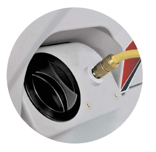
FFS - FAST FILLING SYSTEM

Innova is available on request with a support for your manual cleaning kit, that allows to complete the cleaning operation