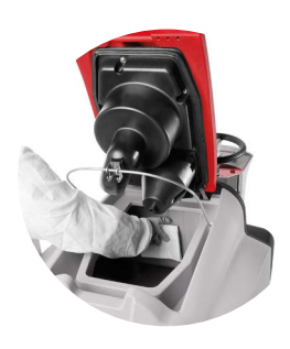
SILENCED VACUUM HEAD AND COMPLETE TANK SANITIZING

A simple device allows the quick filling of the tank with clean water without the presence of the operator