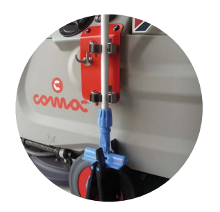
KIT FOR MANUAL CLEANING ACCESSORIES

Innova is available on request with a support for your manual cleaning kit, that allows to complete the cleaning operation