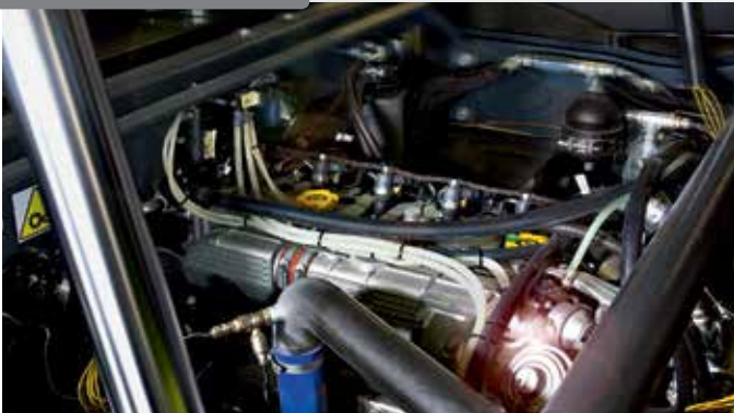
The VM R756 engine power is 140 hp