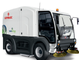
With 2 side brushes (standard)